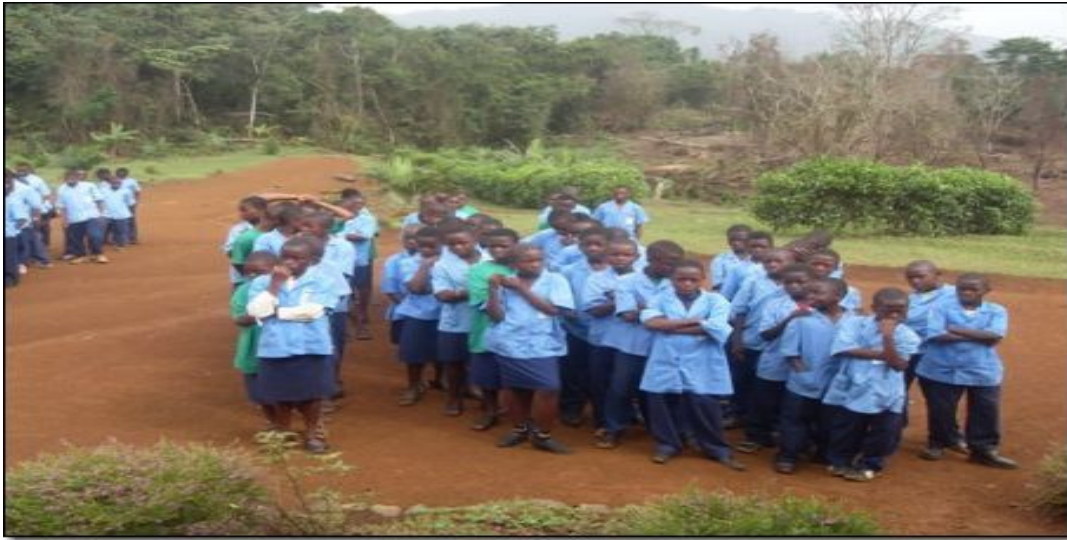
Gov't High School Dikome Balue