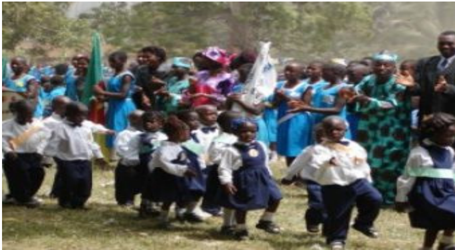
Nursery School Big Bekondo

https://www.booksforafrica.org/donate/to-project.html?projectId=52 for more detail. The collection of books will be developed with the school curriculum primarily in mind. All textbooks for Nursery, Primary, Secondary, and High schools in subjects such as World and African History, Mathematics, Science, English, English Literature, Biology, Chemistry, Business, Computer Science, Economic, Education, Engineering, French, French Literature, Grammar, Philosophy, Physic, Sociology, Psychology, Religion, Geography, Banking, and Marketing, General leisure reading, Reading skills, Social Studies, English language skills, Science, Math, and Health will be provided to the village schools.