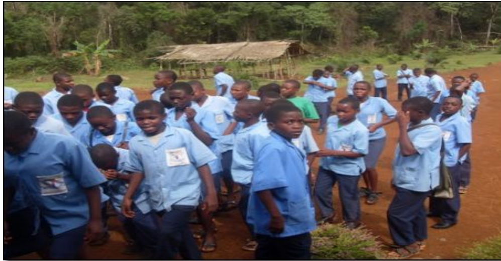
Gov't High School Dikome Balue