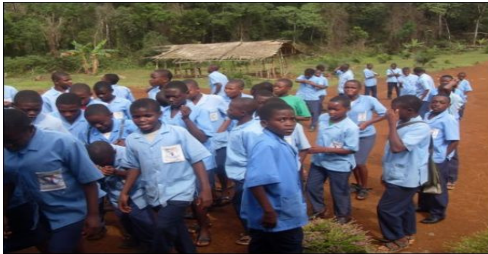
Gov't High School Dikome Balue