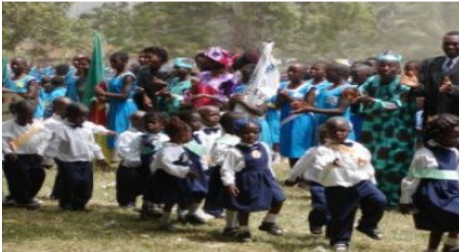
Nursery School Big Bekondo

https://www.booksforafrica.org/donate/to-project.html?projectId=52 for more detail. The collection of books will be developed with the school curriculum primarily in mind. All textbooks for Nursery, Primary, Secondary, and High schools in subjects such as World and African History, Mathematics, Science, English, English Literature, Biology, Chemistry, Business, Computer Science, Economic, Education, Engineering, French, French Literature, Grammar, Philosophy, Physic, Sociology, Psychology, Religion, Geography, Banking, and Marketing, General leisure reading, Reading skills, Social Studies, English language skills, Science, Math, and Health will be provided to the village schools.