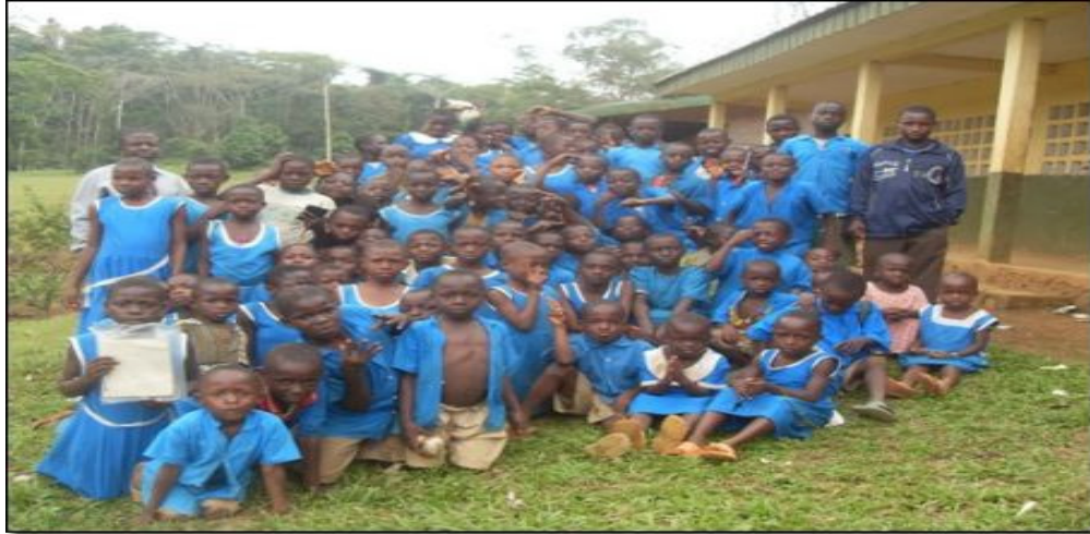
Government Primary School Big Bekondo