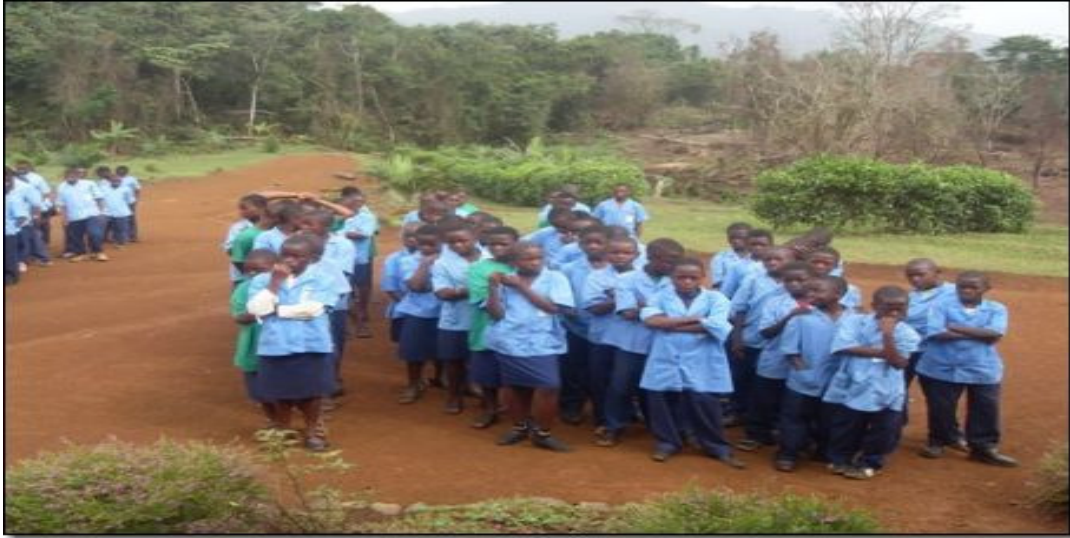
Gov't High School Dikome Balue